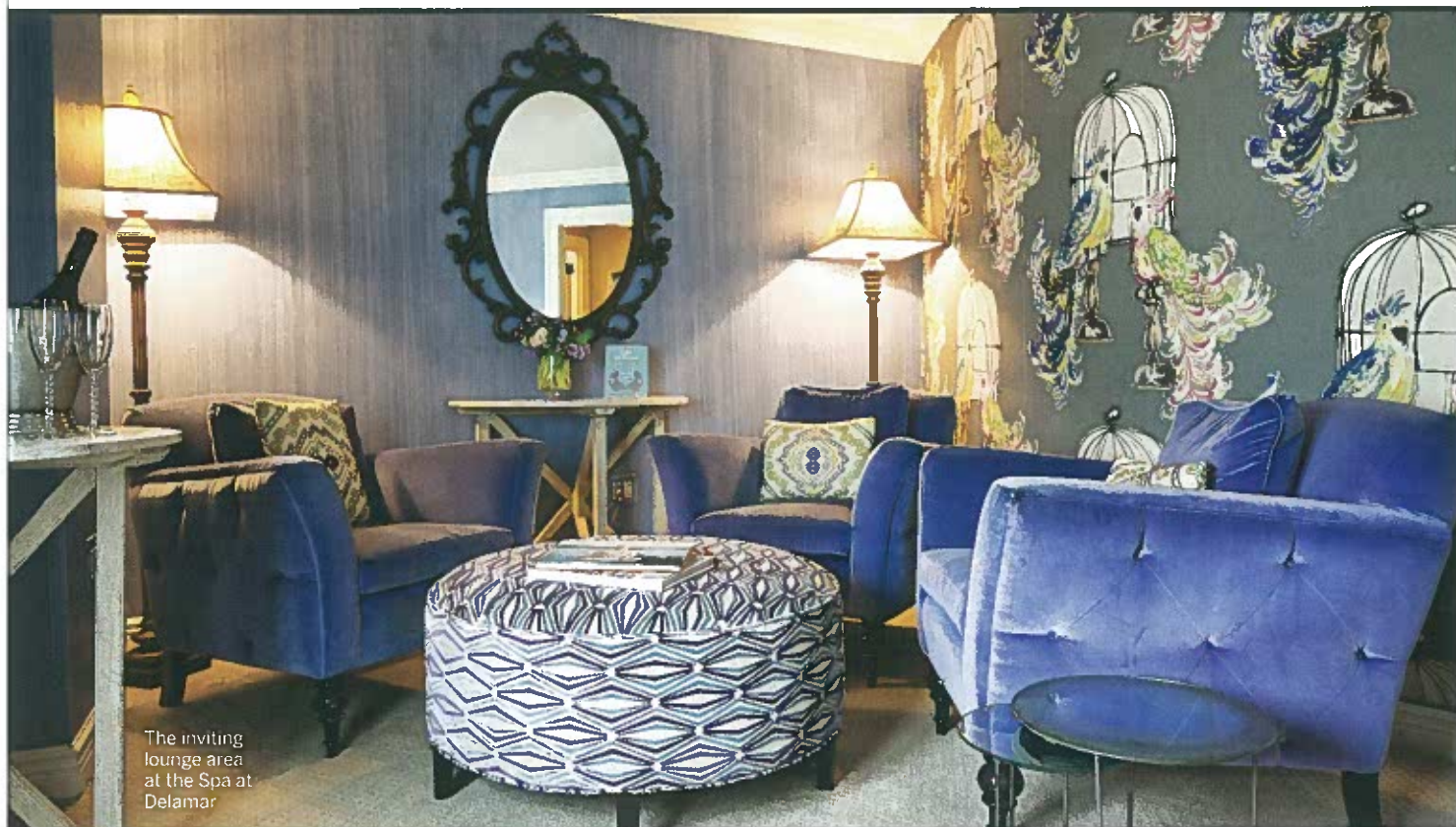
The inviting lounge area at the Spa at Delamar

THE SPA AT DELAMAR • GREAT SUMMER SKIN • GATHERING OF THE VIBES