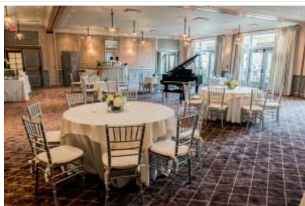
Newly renovated ballroom at Delamar Greenwich Harbor.

The hotel's guests are primarily corporate travelers, couples on a romantic getaway or girlfriends celebrating a special occasion at the spa. And for lunch at the hotel's restaurant, L'escale, the room is always busy with business partners discussing their latest triumphs and patrons enjoying a meal after a day of shopping on Greenwich Avenue.